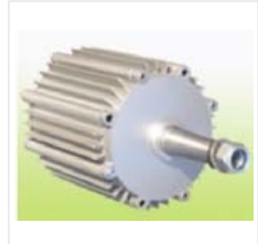
500W Vertical Permanent Magnet Generator for wind turbine generator