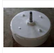
17 5Kw 50rpm low speed Vertical Permanent Magnet Generator for vertical wind turbine