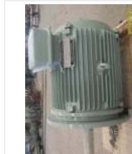
vertical permanent magnet generator 225 frame